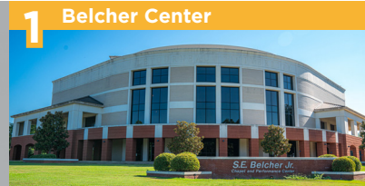
1 Belcher Center