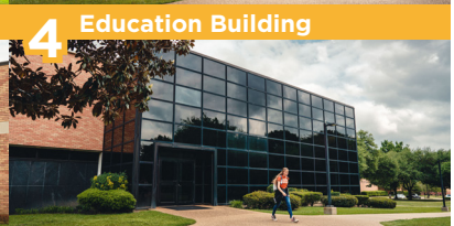
4 Education Building