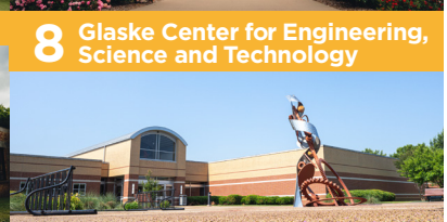
8 Glaske Center for Engineering, Science and Technology