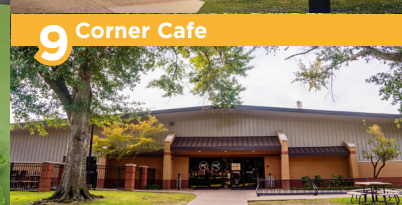
9 Corner Cafe