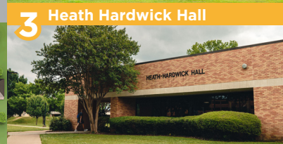
3 Heath Hardwick Hall