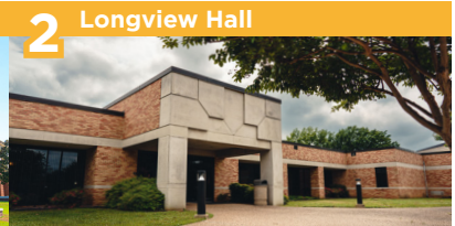
2 Longview Hall