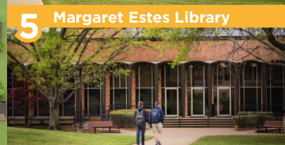
5 Margaret Estes Library