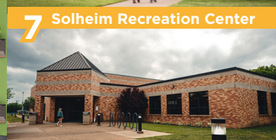
7 Solheim Recreation Center