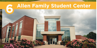
6 Allen Family Student Center